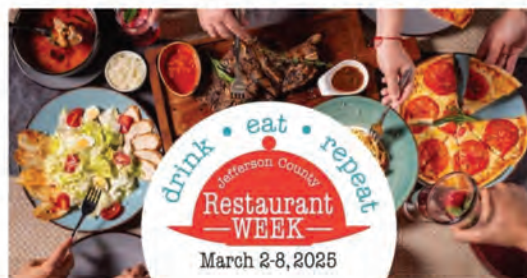
A message from the Jefferson County CVB

The weather is heating up this week and so are the local restaurants! Enjoy delicious dining experiences, price-fix menus, and unbeatable specials and deals at your favorite local spots around Jefferson County.