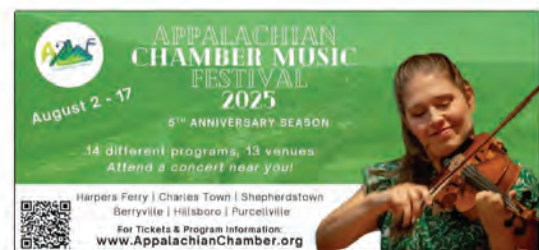
A message from Appalachian Chamber Music Festival

The Appalachian Chamber Music Festival has returned for their Fifth Anniversary Season August 2 – 17. Tickets are still available for this weekend including our Festival Highlights event on Saturday, August 16 in Harpers Ferry. For more information visit